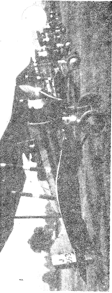
Grebe IIs of No. 25 Squadron, R.A.F.